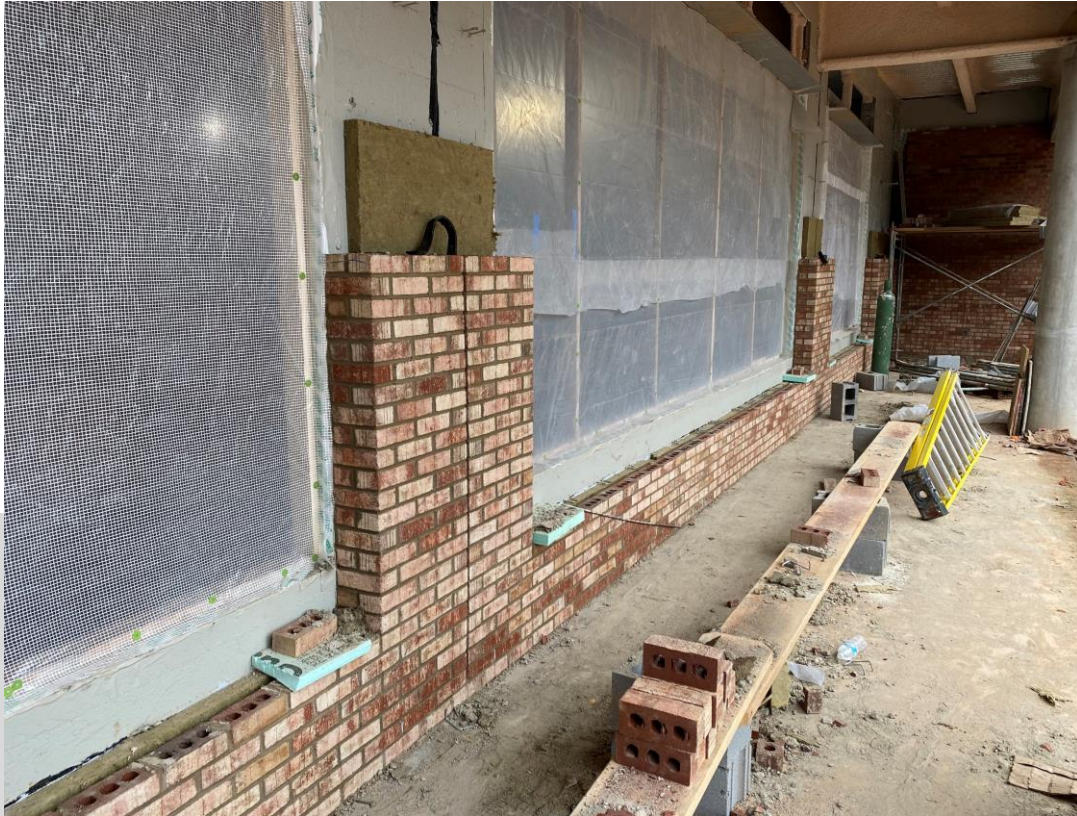
South Elevation Brick Progress at New Addition