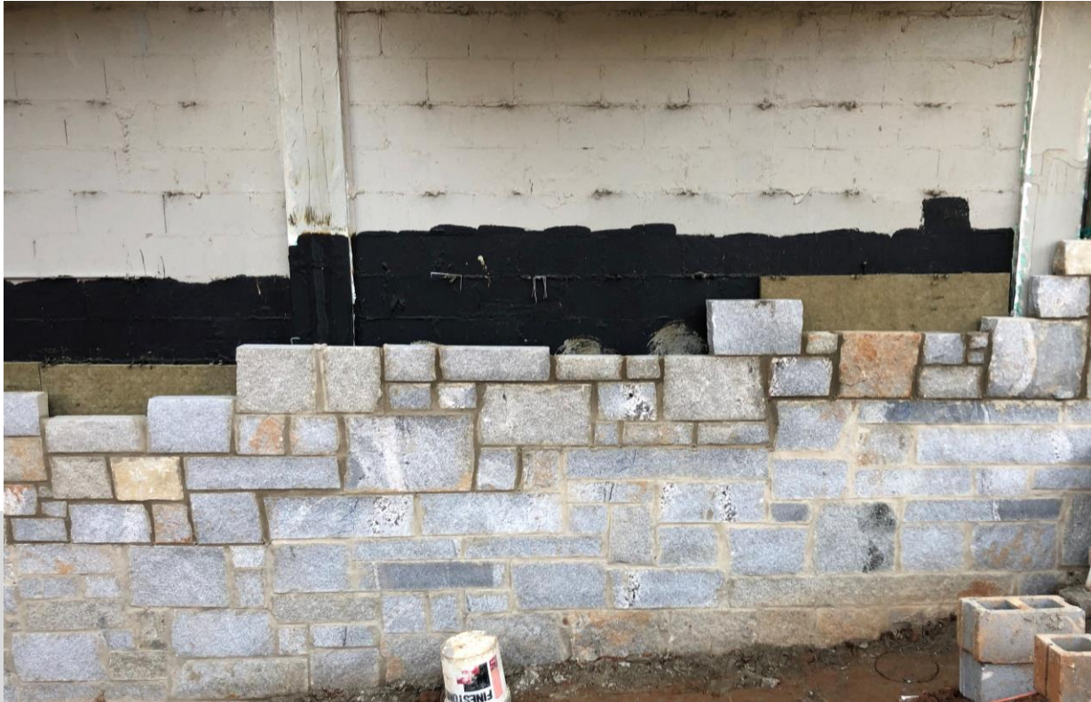
Granite Progress on West Elevation at New Addition