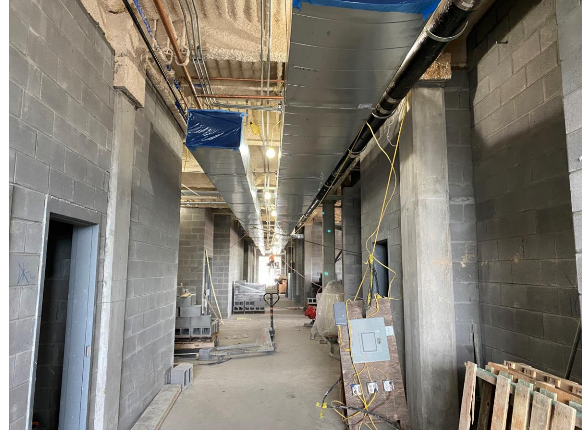
MEP Overhead Progress 4 th Floor of New Addition