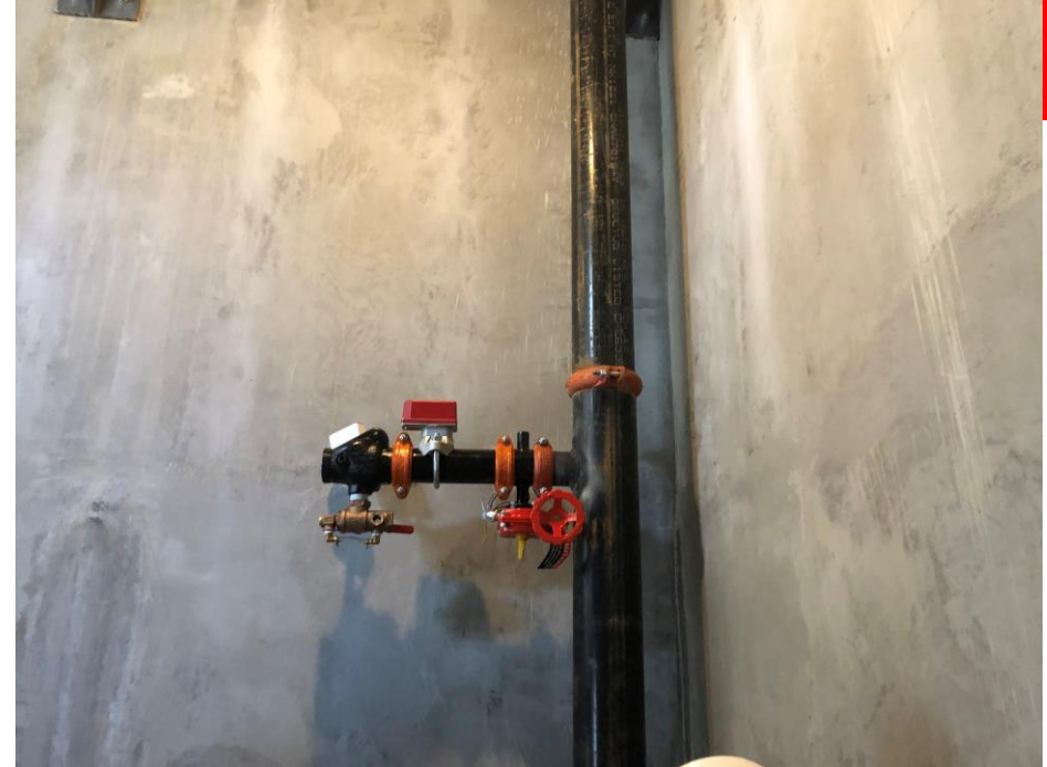
Fire Sprinkler Progress in Stair 1 of New Addition